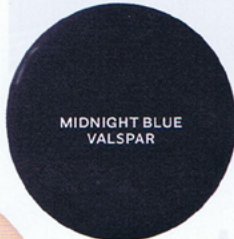
MIDNIGHT BLUE VALSPAR