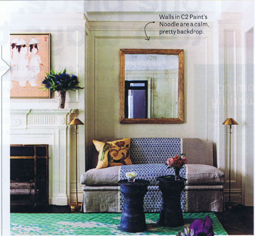
Walls in C2 Paint's Noodle are a calm, pretty backdrop.