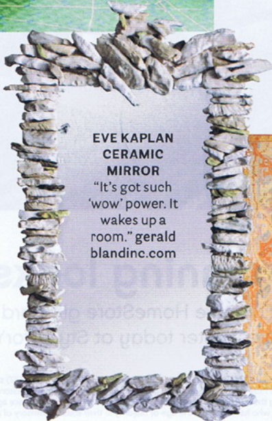
EVE KAPLAN CERAMIC MIRROR

▲ PALETTE "Midnight blue, pale peach, and coral—it makes me think of Art Deco rooms and tropical birds."