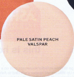
PALE SATIN PEACH VALSPAR

▲ PALETTE "Midnight blue, pale peach, and coral—it makes me think of Art Deco rooms and tropical birds."